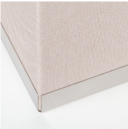
Brushed stainless steel base