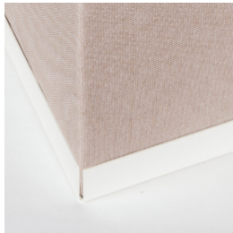
White powder-coated steel base