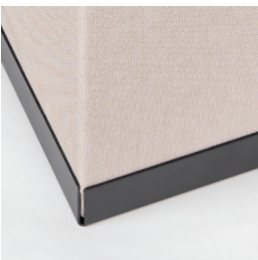
Black powder-coated steel base