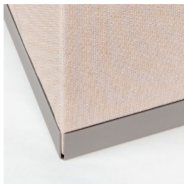
Grey powder-coated steel base